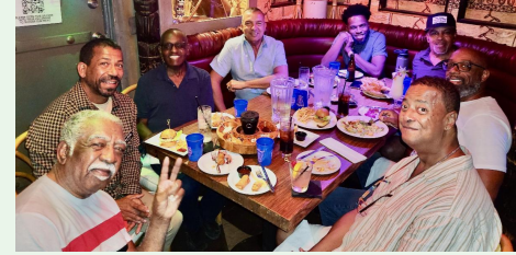
Community Advisory Board for the Barbershop Project held their first meeting on July 5th