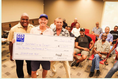
GED presents a check to BOD from the proceeds of the Equality Wine Fest on July 8.