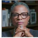
Bishop Yvette Flunder